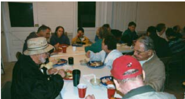
Dinnertime at Shelter Neck

For over a century, Shelter Neck has been a meeting place for Unitarian Universalists. Located in rural southeastern North Carolina, Shelter Neck originated as a school for children who otherwise would not have had access to education or broad cultural experiences. The National Alliance of Unitarian Women established the school in 1902 and provided students with studies in literature, languages, and fine arts along with the "3-Rs". The students returned the favor by providing Southern hospitality and devotion to their teachers and their school. Together, they shared a certain warmth which is still experienced today and permeates the atmosphere of the campus. In addition, the experimental farming at Shelter Neck was a forerunner of the state's agricultural experiment stations. The Future: A Wilmington consulting firm has worked with a UCONCI committee in formulating long-range plans for future construction to include campsites, playground, bathhouse/restroom facilities, volleyball and tennis courts, meditation and nature trails. While progress has been hindered by Hurricane and flood damage and repairs in 1999, the $65,000 restoration project and hard work of many volunteer supporters has spurred a resurgence in use and interest among UU Congregations in North Carolina and beyond. Shelter Neck is truly becoming what its founders envisioned it to be. Plans are being made for the next major expansion. Come be a part of our future.