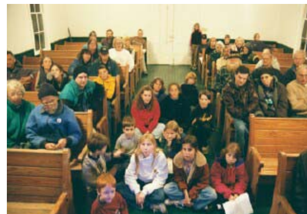
Inside Shelter Neck Chapel the children like to get up close